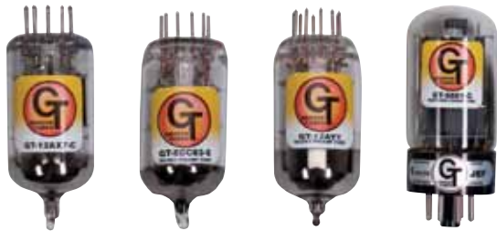
A. GT-12AX7-C B. GT-ECC83-S C. GT-12AY7 D. GT-5881-C